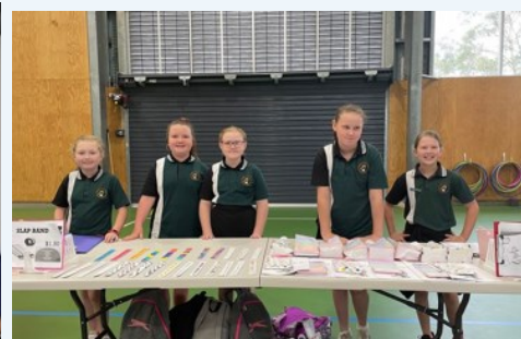
EPP markets at Kin Kora State School